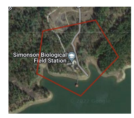
Biological Field Station